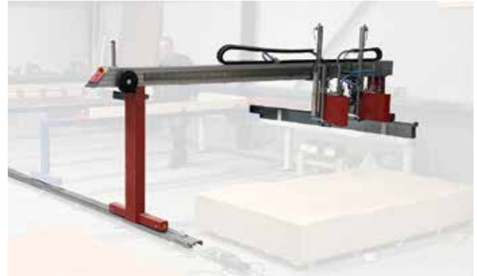
Floor + Table Mount (on request)